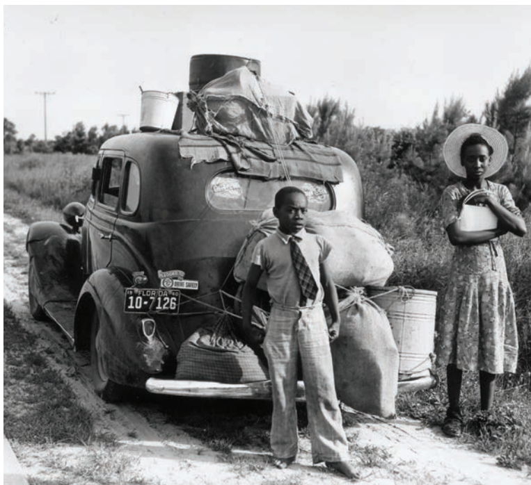
Photograph of a family leaving Florida, 1940. The Great Migration, during which more than six million African Americans moved out of the southern United States, can only be fully understood within the context of the history of American slavery.

that luminaries such as writer and educator Ta-Nehisi Coates and others have covered at length. None of the textbooks that we reviewed make meaningful connections to the present day, either through showing the influence of African culture or by explicating the persistence of structural racism. None of the state standards documents we reviewed make these connections. How can students develop a meaningful understanding of the rest of U.S. history if they do not understand the scope and lasting impact of enslavement? Reconstruction, the Great Migration, the Harlem Renaissance and the civil rights movement do not make sense when so divorced from the arc of American history. We can do better than insisting to students that the horror of slavery is over and the good guys won. We would do well to model instruction after the example of this teacher, who says that the instructional goal when teaching about slavery is “[t]o explain how arguments used to support the slave industry created a context in which African Americans are viewed as different/less than/dangerous, which created a basis for things like Jim Crow laws and workplace