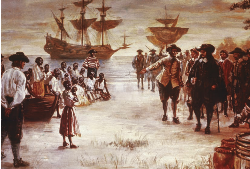
A depiction of Dutch enslavers bringing enslaved Africans to Jamestown in 1619. The first slavers' ships arrived only 12 years after the founding of the settlement, the first permanent British colony in what would become the United States.