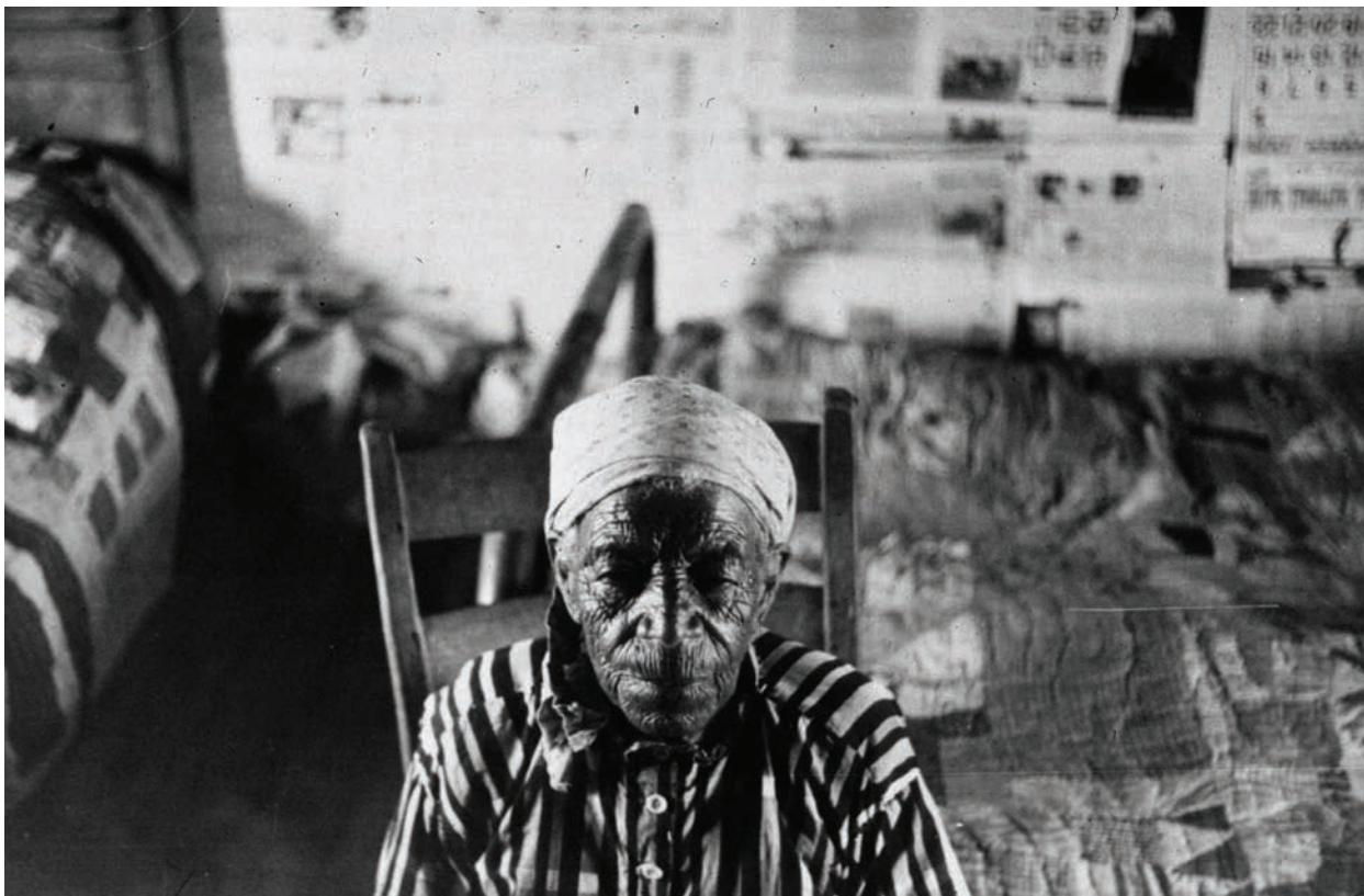
In the 1930s and 40s, the Works Progress Administration and Farm Security Administration photographed the daily lives of thousands of formerly enslaved people, tenant farmers and sharecroppers. This photograph of a woman born in enslavement was taken in Greensboro, Alabama, in 1941.

requirements for learning about slavery, about the lives of the millions of enslaved people, or about how their labor was essential to the American economy.